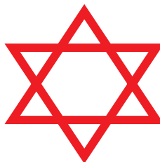
Red Shield of David