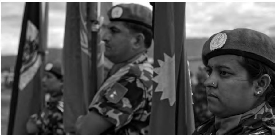
▲ Nepalese peacekeepers on parade. Port-au-Prince, Haiti. March 2009.

Operational advice to Member States should also stress the importance of nominating a dedicated gender focal point within every military contingent, with clear terms of reference. The military gender focal point would provide ongoing advice to contingent commanders on how a gender perspective can enhance the efficiency and effectiveness of the contingent's operational tasks, and would offer targeted in-mission gender training to members of the contingent. The gender focal points would serve as principal points of liaison between the contingent and the peacekeeping mission's Office of the Gender Adviser.